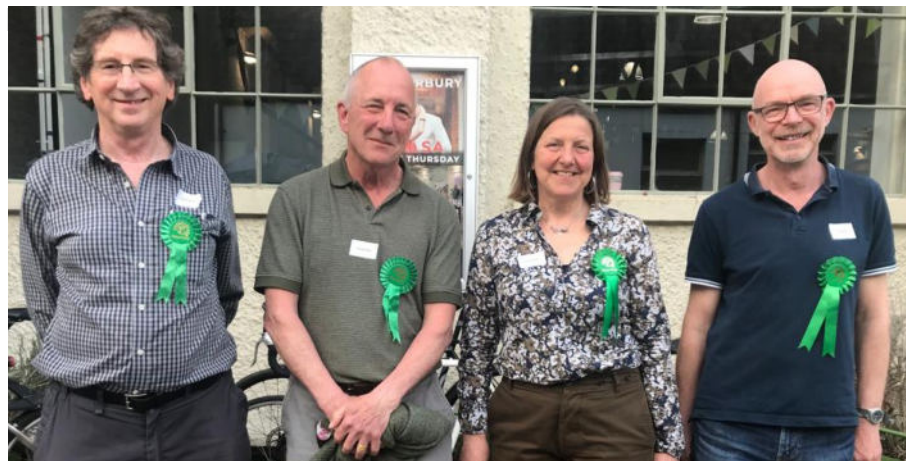
Canterbury’s four Green councillors

Labour/Lib Dem alliance. With its 4 councillors, the Green Party is now in a position to challenge poor decisions, push for improvements and to contribute to the Local Plan.