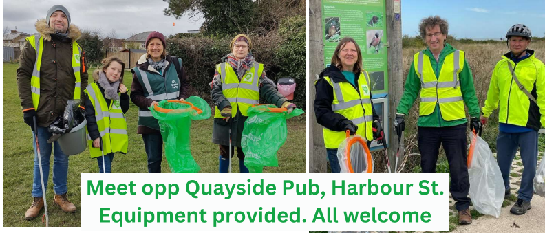
Meet opp Quayside Pub, Harbour St. Equipment provided. All welcome